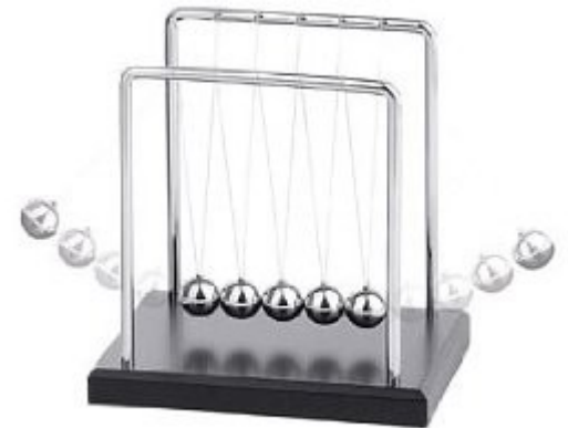
Side on =>